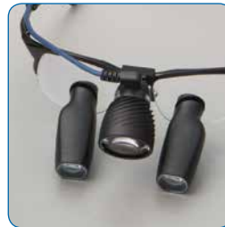
LED DayLite HDi