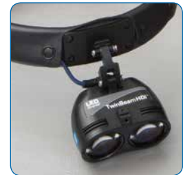
LED Twin Beam HDi