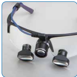
LED UltraMini HDi